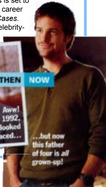
Life & Style Weekly, April 24th, 2006, page 40